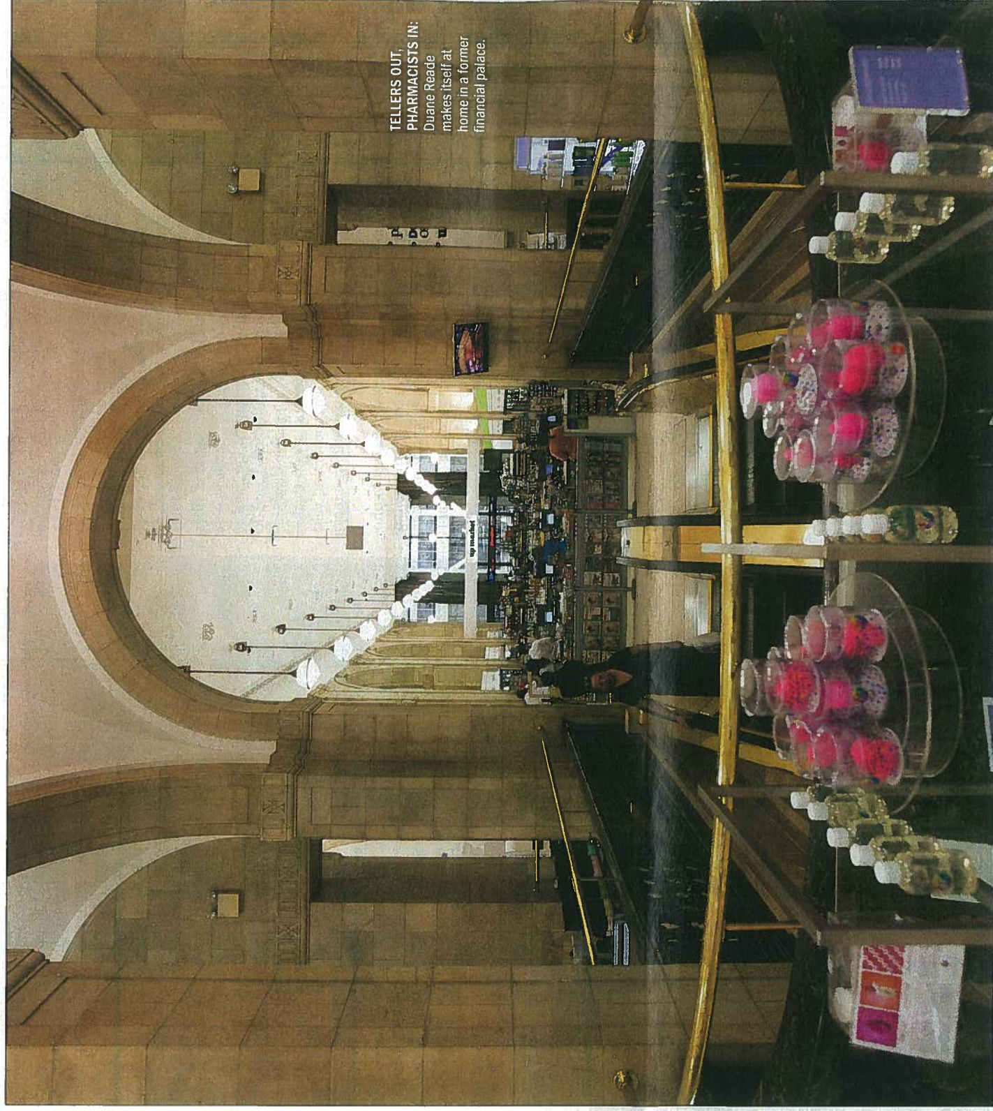
TELLERS OUT, PHARMACISTS IN: Duane Reade makes itself at home in a former financial palace.